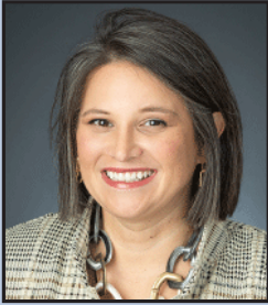
Noell Myska Terry's Landscape & Design