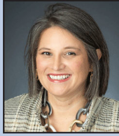
Noell Myska Terry's Landscape & Design